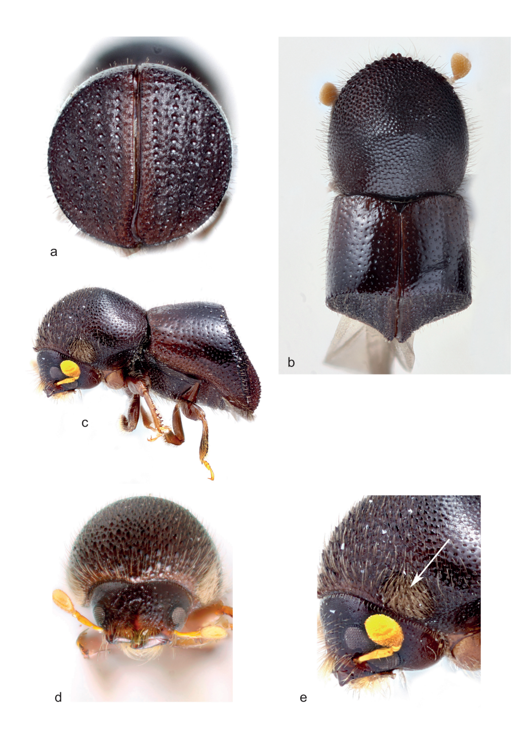
Fig. 1: Cnestus schoenmanni , female: a) caudal view, b) dorsal view, c) lateral view, d) frontal view, e) mycangium on antero-lateral area of pronotum.