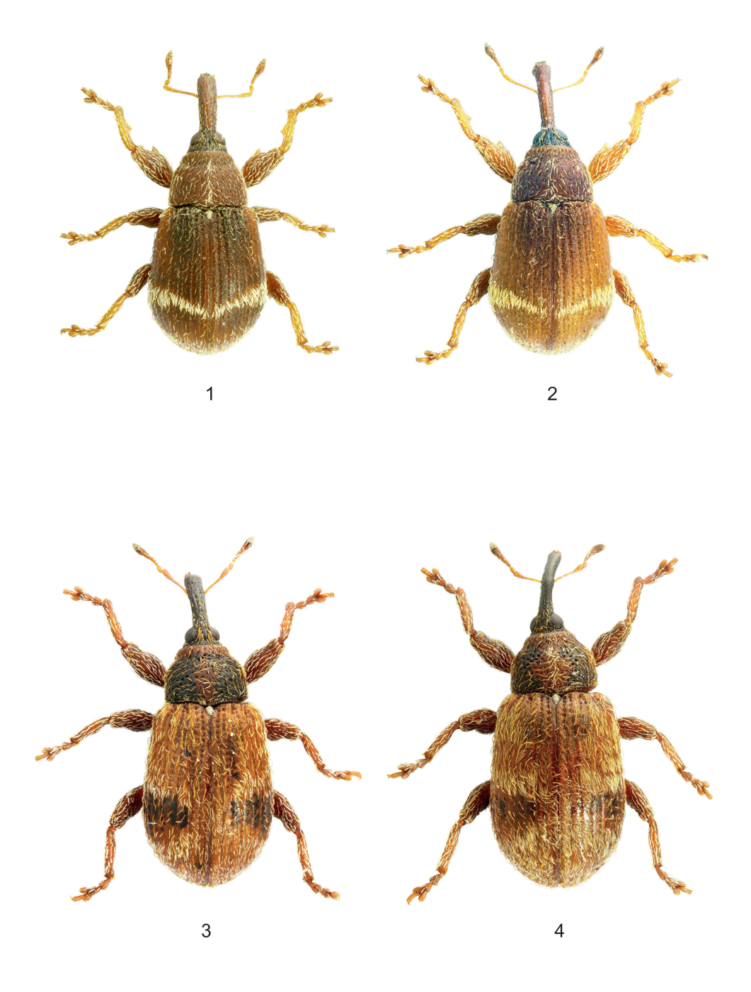
Figs. 1–4: Habitus of 1–2) Bradybatus schoenmanni , 1) male (paratype), 2) female (paratype); 3–4) B. ne-methi , 3) male (holotype), 4) female (paratype).