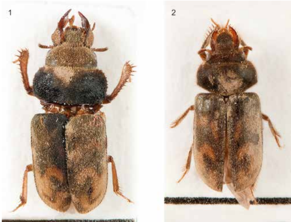
Figs. 1–2: Augyles gigas , 1) holotype, 2) paratype \alpha .